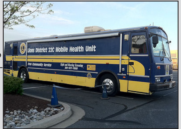
Sight Bus

Cicchiaro also noted that in addition to collecting hundreds of pairs of “gently used” eye glasses, his unit has collected several hundred hearing aides since 2011 and is developing a program for them to be refurbished and distributed to those in need.