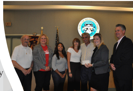
Sept. 26 Meeting