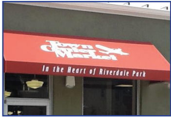
TCM TOWN CENTER MARKET