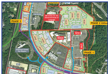
M 2 UNIVERSITY OF MARYLAND