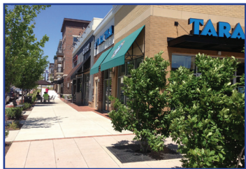
EYA ARTS DISTRICT