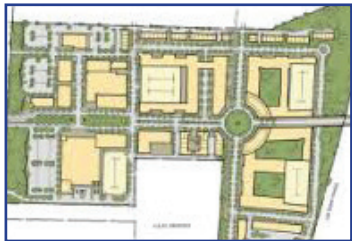
WHOLE FOODS CAFRTZ DEVELOPMENT