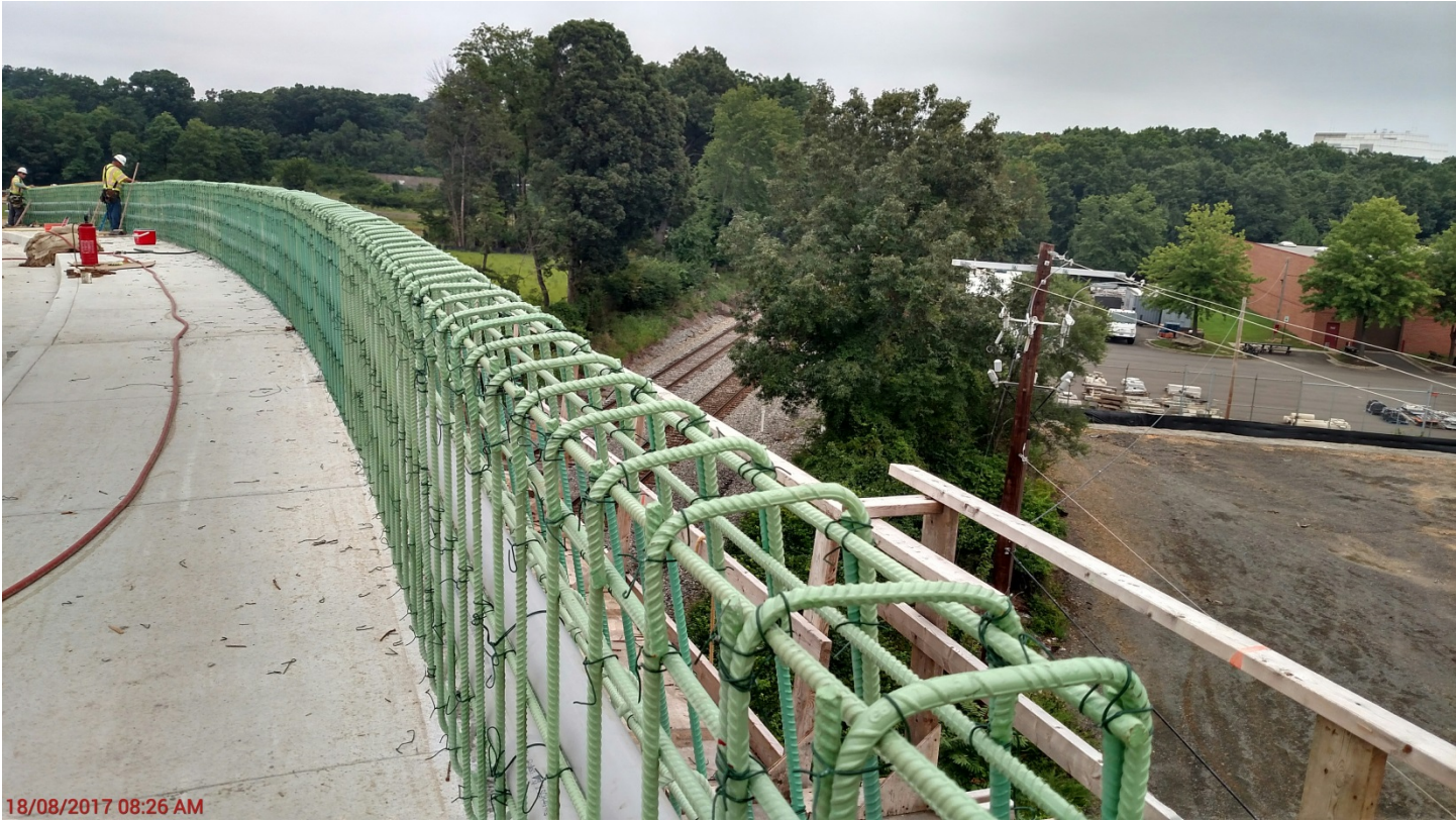
Picture: North Bridge Wall Reinforcing – Looking North – August 18, 2017