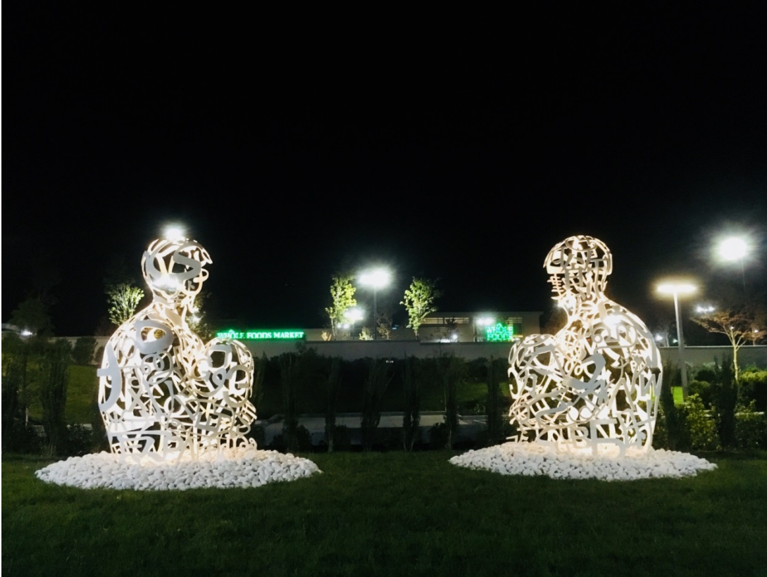
Picture Below: View of Bear Square and 45 th Street from Whole Foods Market